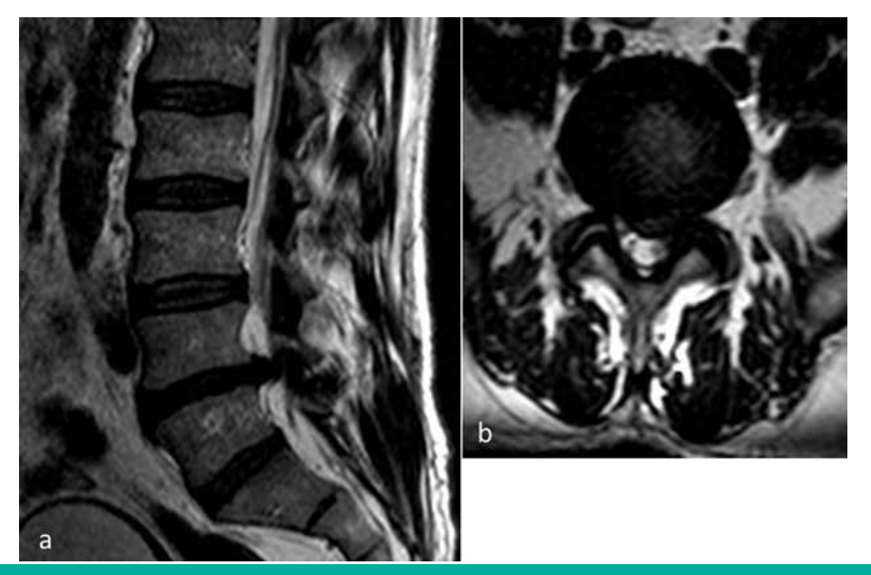
Figure 1: A left L4-5 lumbar disc herniation with a wide basis was seen on the T2-weighted sagittal (a) and axial (b) MRI sections before percutaneous hydrogel implantation.

A 61-year-old male was admitted to our outpatient clinic with complaints of low back and severe left leg pain. His history revealed that he had suffered from low back pain for 2 years and had been treated with a percutaneous hydrogel implantation into his degenerated L4-5 disc level (Figure 1) in the Pain Clinic at our hospital. A very severe left leg pain