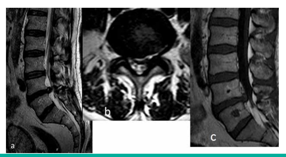
Figure 2: A lesion mimicking lumbar disc herniation and annular defect was seen on the T2-weighted sagittal (a), T2-weighted axial (b), and T1 weighted sagittal (c) MRI sections 6 months after percutaneous hydrogel implantation. It was noted that the lesion was hyperintense on T2-weighted and hypointense on T1-weighted MRI section.