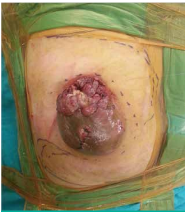
Figure 1: Macroscopic preoperative appearance of the lesion on the left buttock