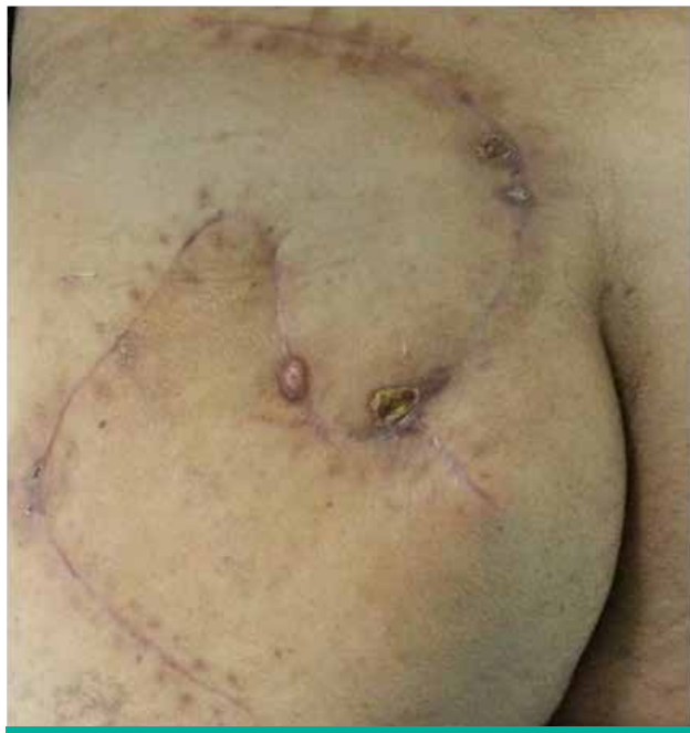
Figure 5: Macroscopic appearance of the lesion in the left buttock at control 2 months postoperatively

cancer-related deaths (1,4). This cancer is usually high-grade and metastatic when diagnosed. Life expectancy in metastatic pancreatic cancer is usually 3-6 months (1,4). The aim of treatment is palliation, pain control, and support of the patient's life comfort. In our patient, the large, ulcerated, and draining lesion in the left gluteal region reduced his quality of life. The axillary mass caused severe pain and was removed to control pain.